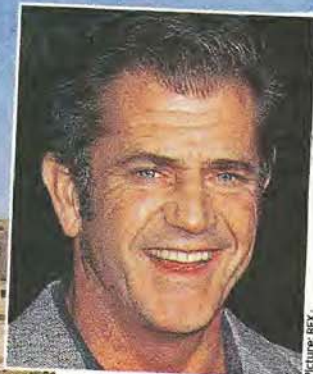
On Location in Matera: Mel Gibson, who directed The Passion Of The Christ

Should you prefer a more Tuscan-style setting, Landscape Properties